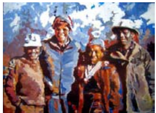
Base Camp Smiles