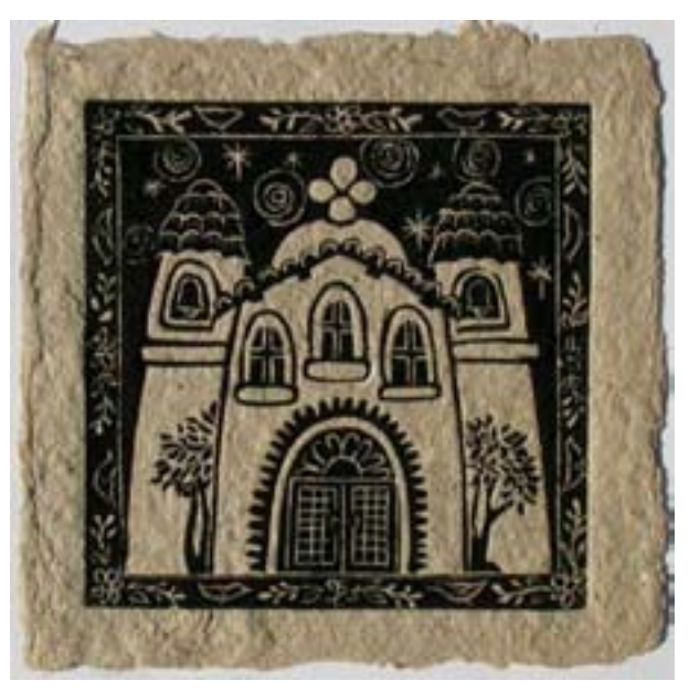
La Mision, a popular piece on thick hand-made paper.