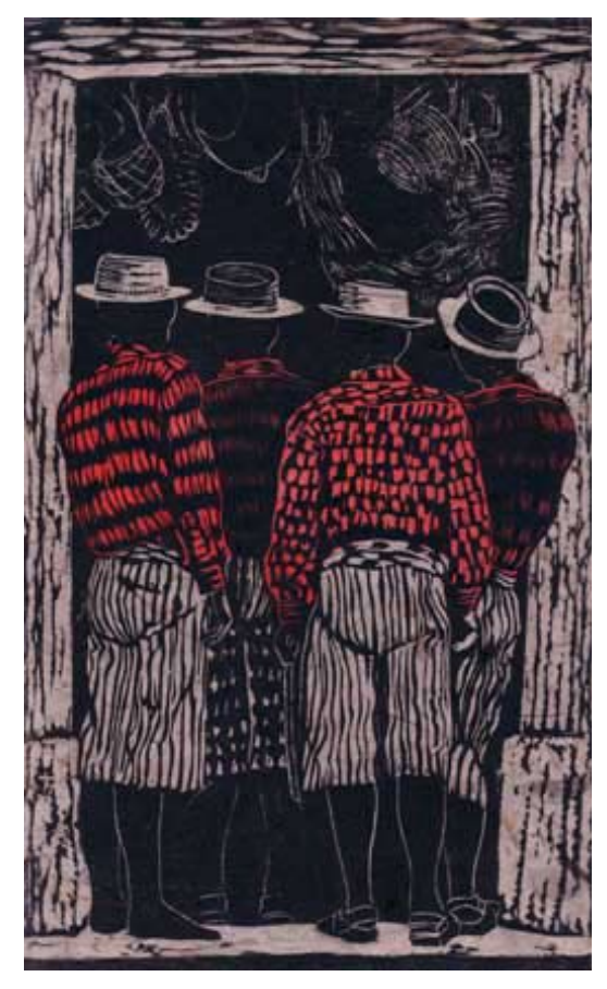
Getting the News, Guatemalan men in traditional dress, standing at a basket-seller's stall.