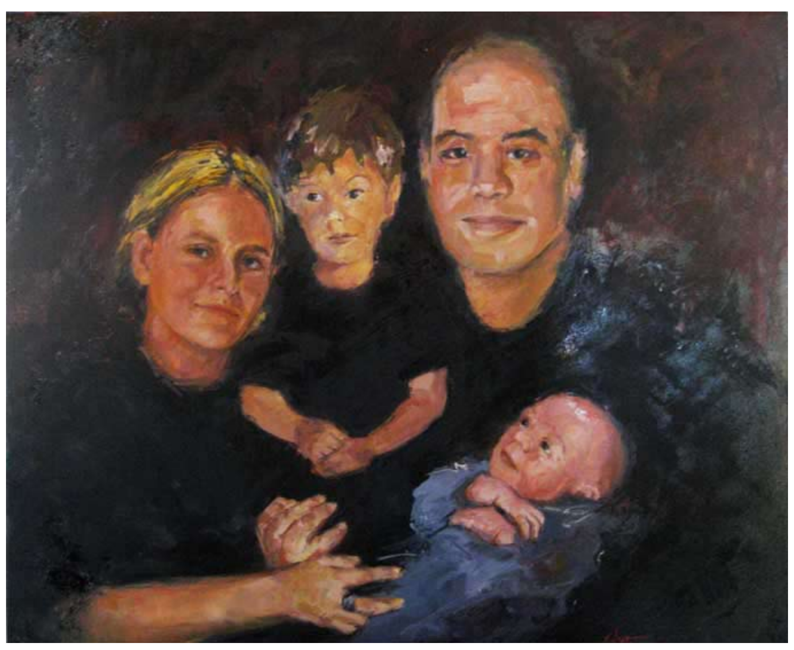
Lambert Family Portrait, oil on canvas, 20"x24."