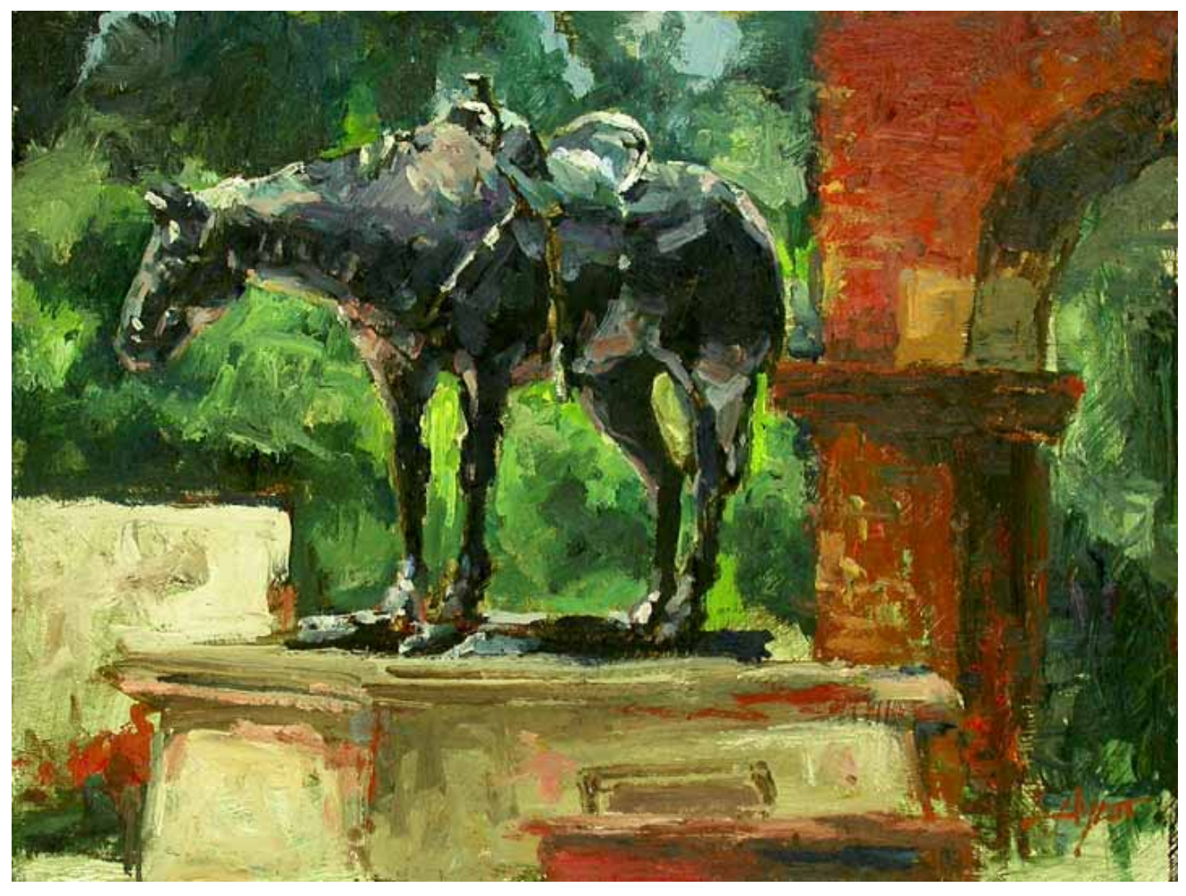
Portola Pony 2, Oil on Board, 12"x16." Click on image for larger view.

Summer Plein Air Painting Explorations in Color A Couple of Commissions New and Large Monotypes New Gallery in Lake Oswego, Oregon