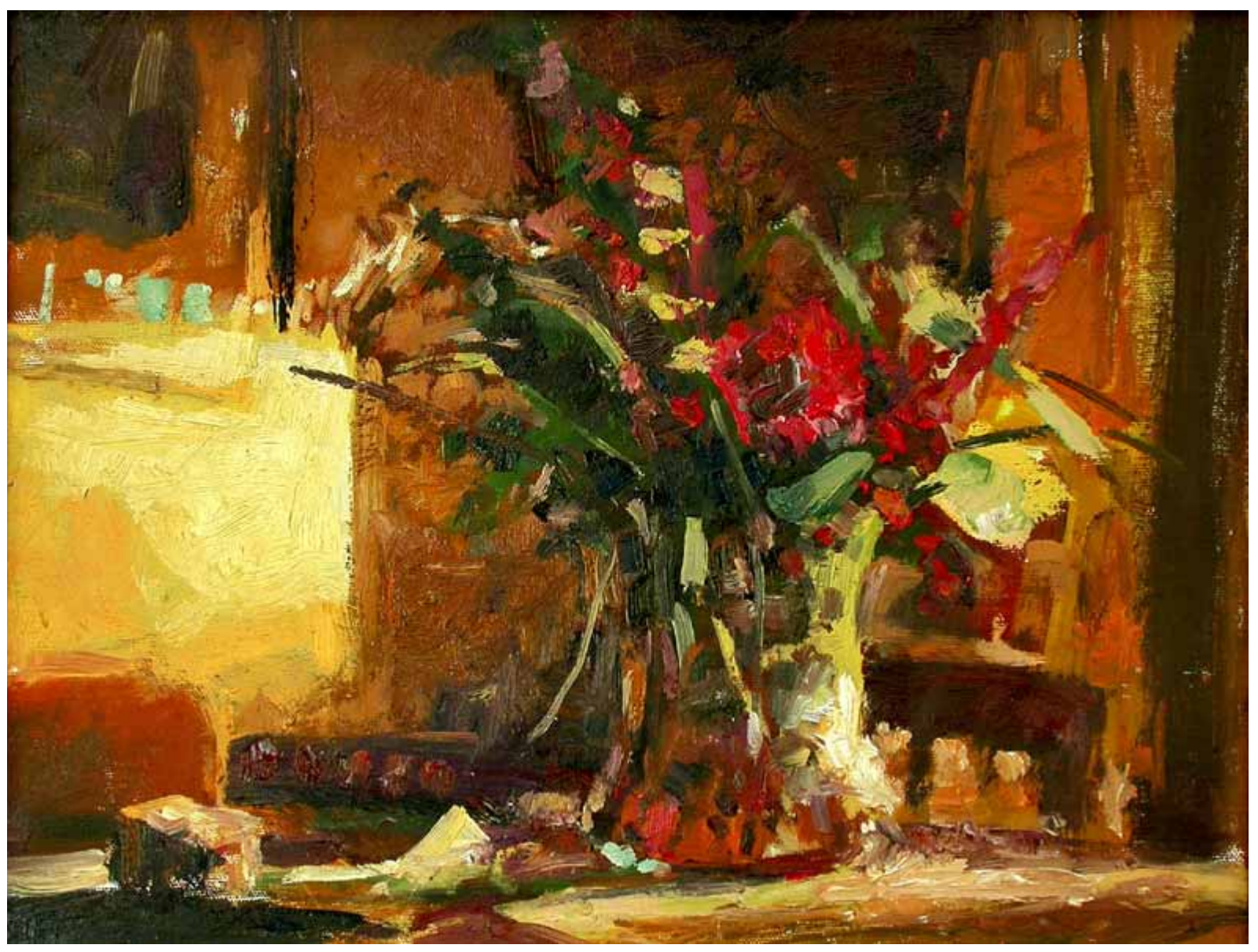
Afternoon Light, Oil on Canvas, 12"x16." Click here for other pieces at Robert Doerr Gallery.