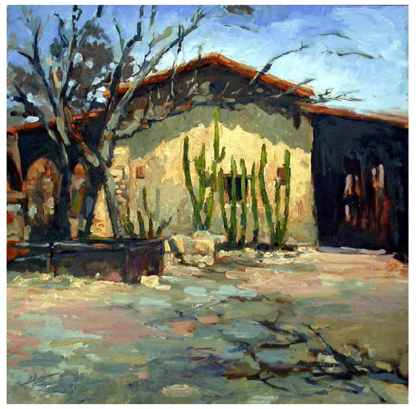
Mission Shadows, Oil on Canvas, 24"x24." Click on image for larger view.

painting than the one you started in the morning, on the same canvas! So, there are certain lessons that can only be learned out of doors. It's one of the reasons the Impressionists preferred it and established a whole new way of painting.