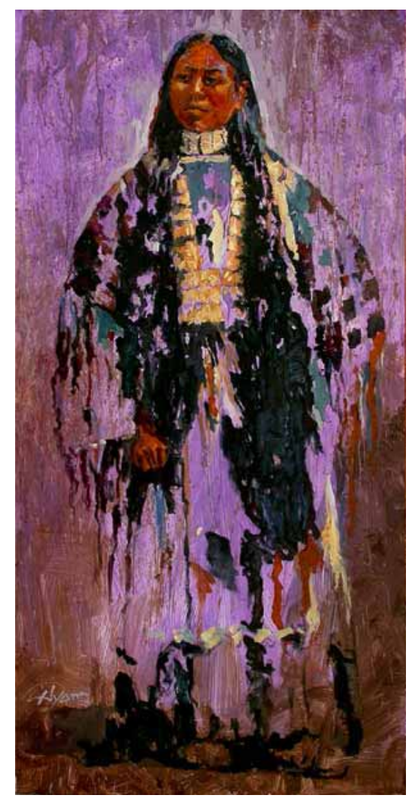
Cheyenne Girl, Teals, Golds, Lavenders, Oil over Acrylic on Canvas, 48"x24." Click on pictures for more.

Getting ambitious, I found an archival photo of a Cheyenne girl in tribal regalia. Being shot sometime over a century ago, it was in black and white (or sepia). I took great liberties with the original muslin and buckskin. But, why not? She might have too, had she had the choice. As it was, along with this photo was another of her posed for her wedding with her groom. Both were dressed in English attire, with her in a white wedding gown. I must say she looked out of place, and much less beautiful than in these clothes. I suppose there's a lesson:we should all be true to ourselves. That truth, for some of us, means experimenting in color.