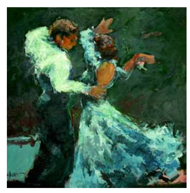
Flamenco Frolic, Golds, Reds, and Blues, respectively, Acrylic on Canvas. 20"x20." Click on images for larger views.