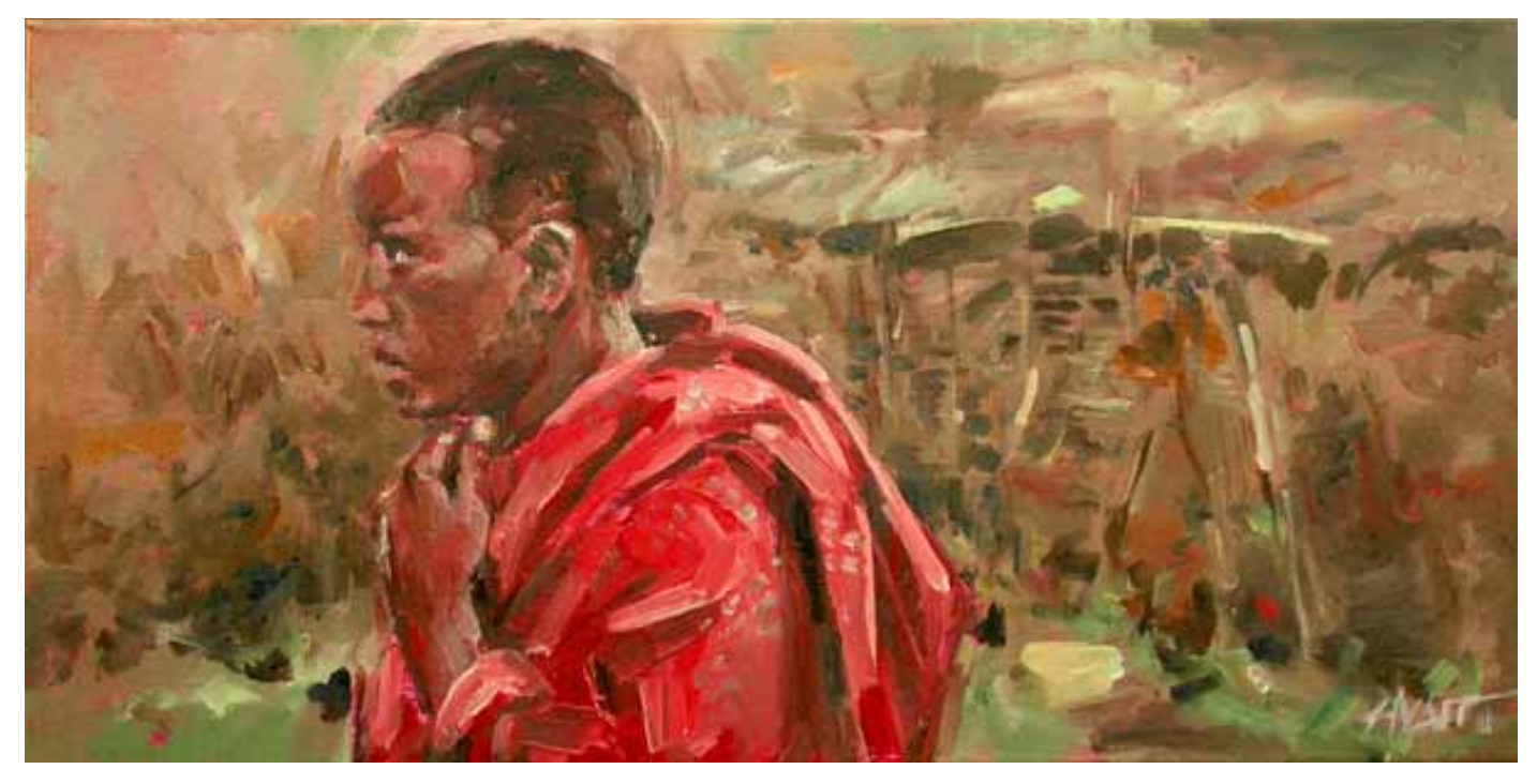
Masai Village Boy, Oil on Canvas, 12"x 24"