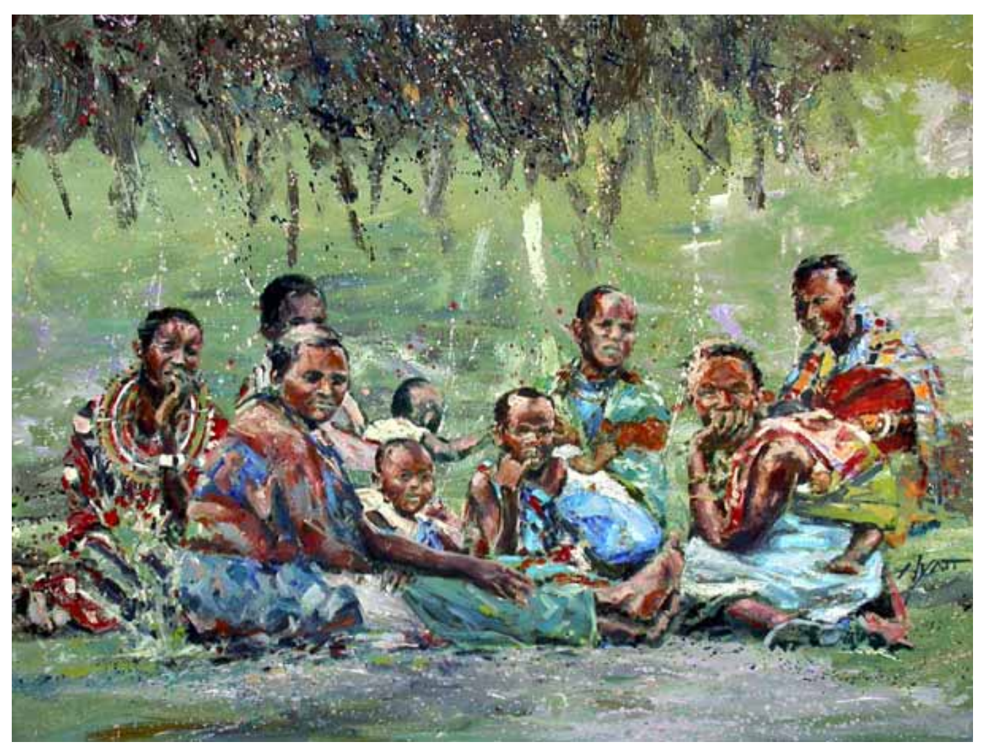
Masai Day Care, Oil over Acrylic on Canvas, 30"x40"