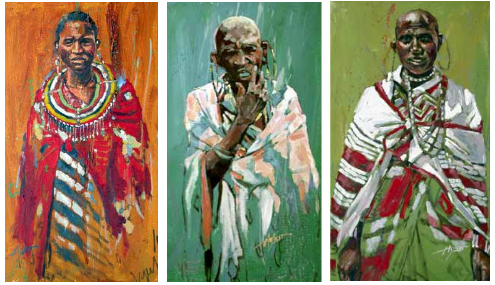
Masai Woman on Wood, Oil, 25.5"x 13"

A New Presence in Santa Fe A Few from the Masai Series Other Nations Sprinkled In Wiford Gallery