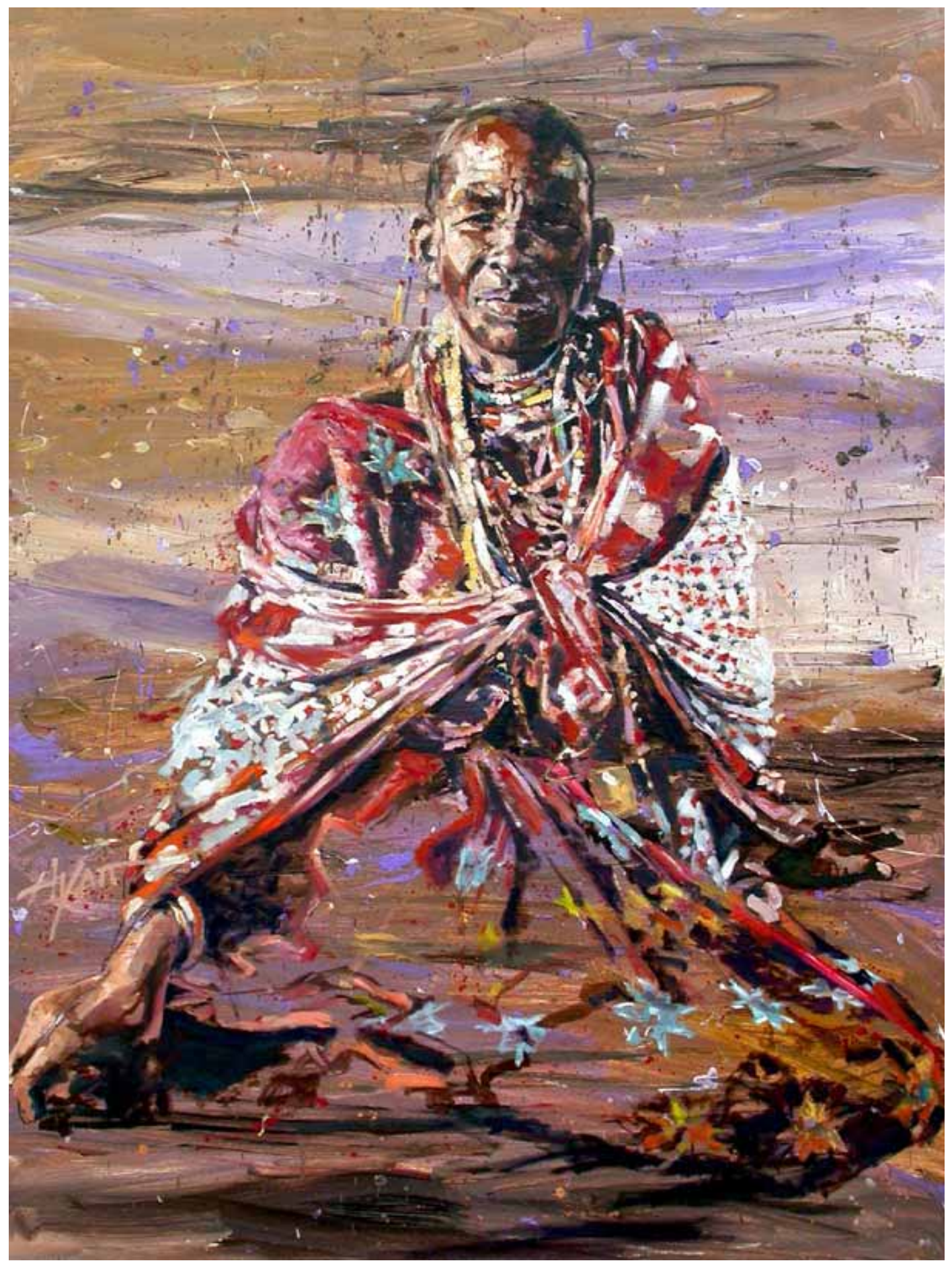
Masai Serape, Oil over Acrylic on Canvas, 48"x 36"