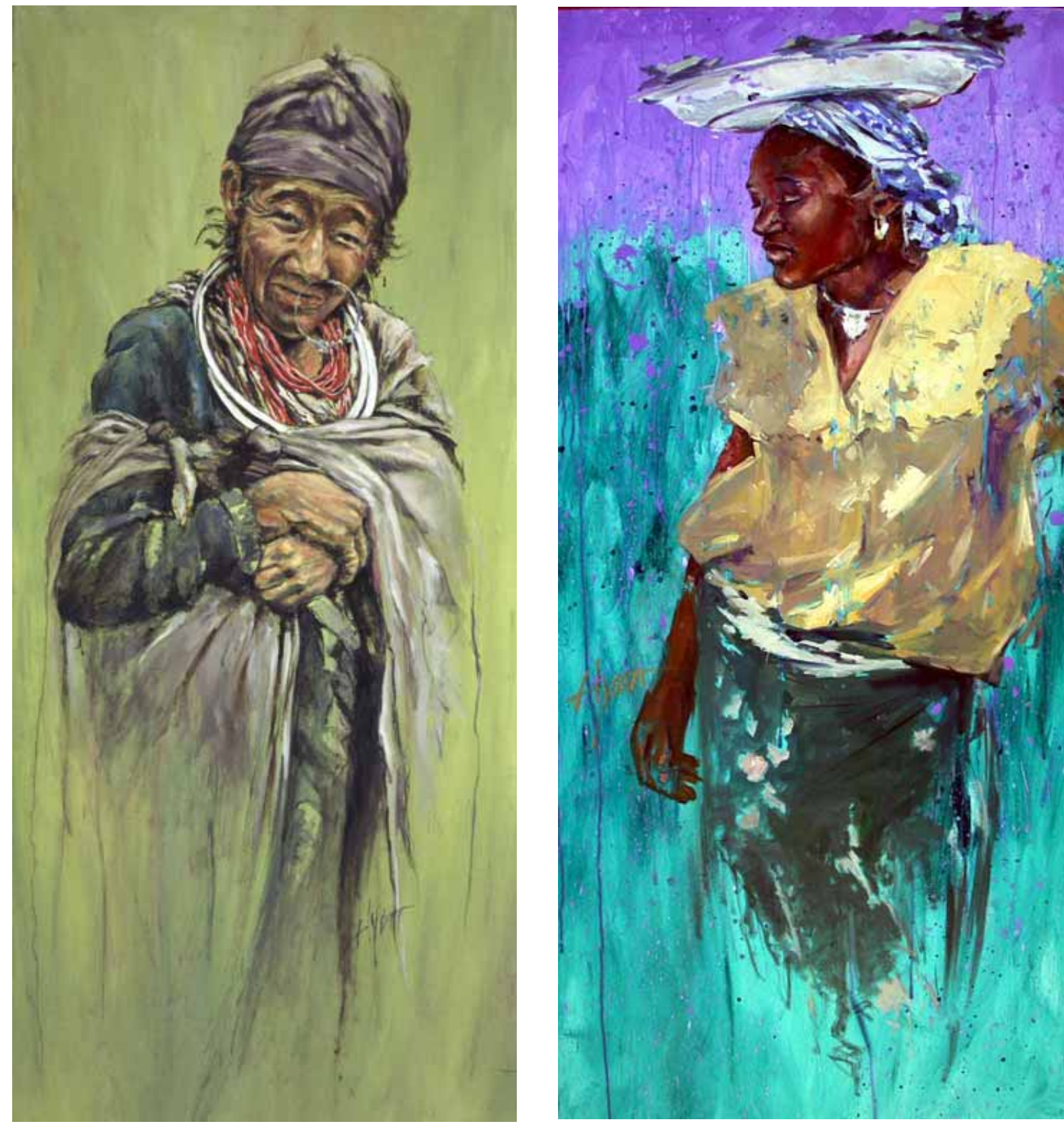
Nepal Grandma, Oil on Canvas, 60"x27" (life size)