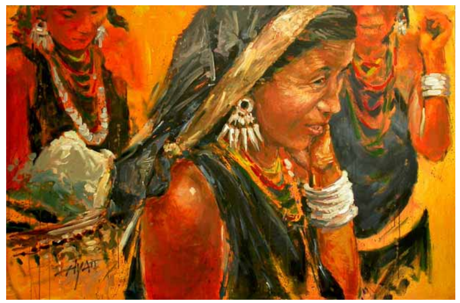
Thai Trio, Oil over Acrylic on Canvas, 48"x 72"