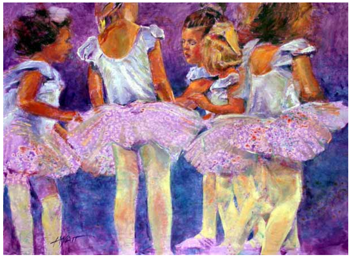
Ballerinas in Lavender, Oil on canvas, 36x48, on display at Diedrich's in San Juan