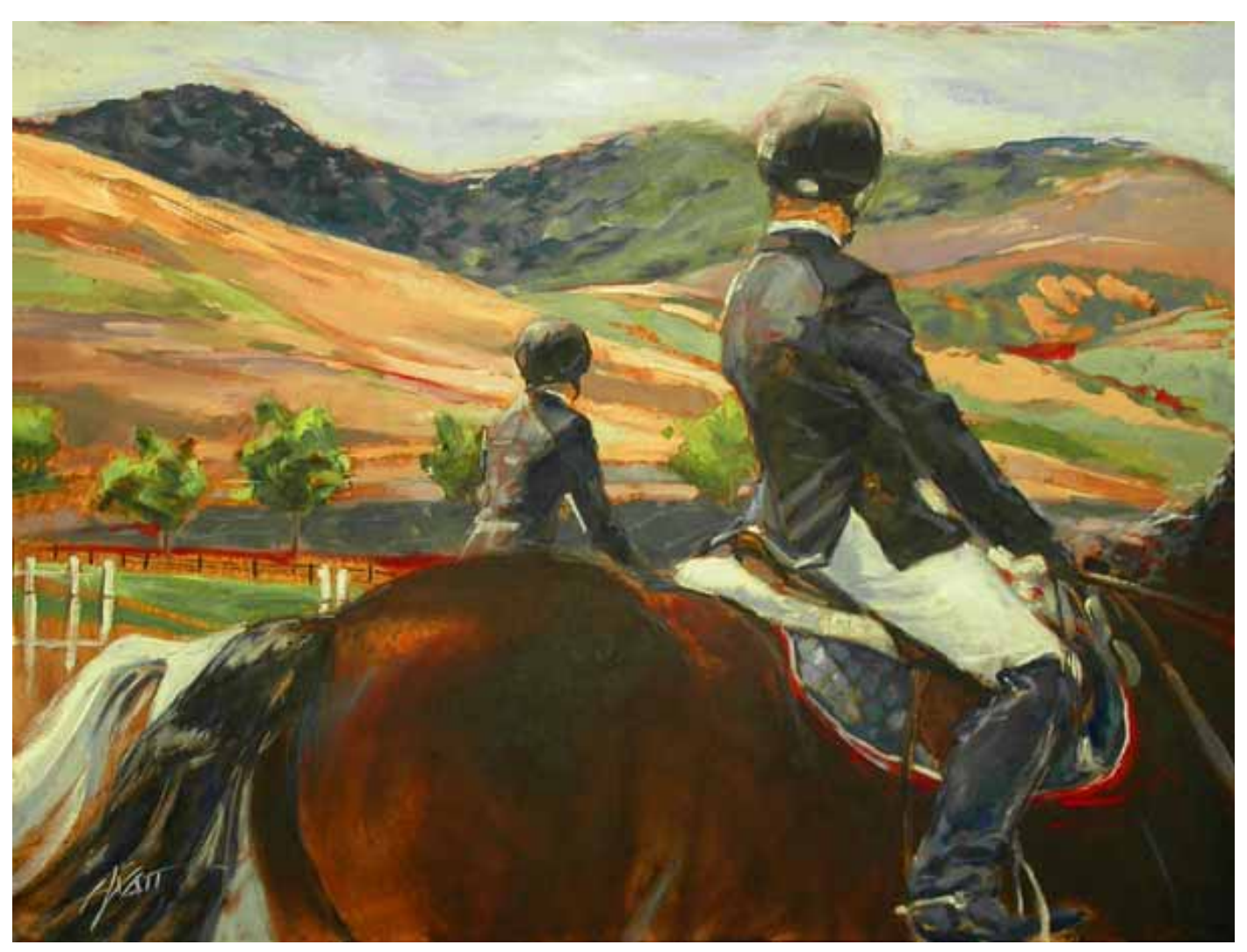
Young Riders, Oil on Canvas, 36"x 48," Available at Reflections Gallery, San Juan Capistrano, CA