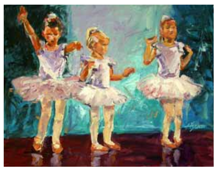
Ballerinas, Number 3, Oil on canvas, 14x18