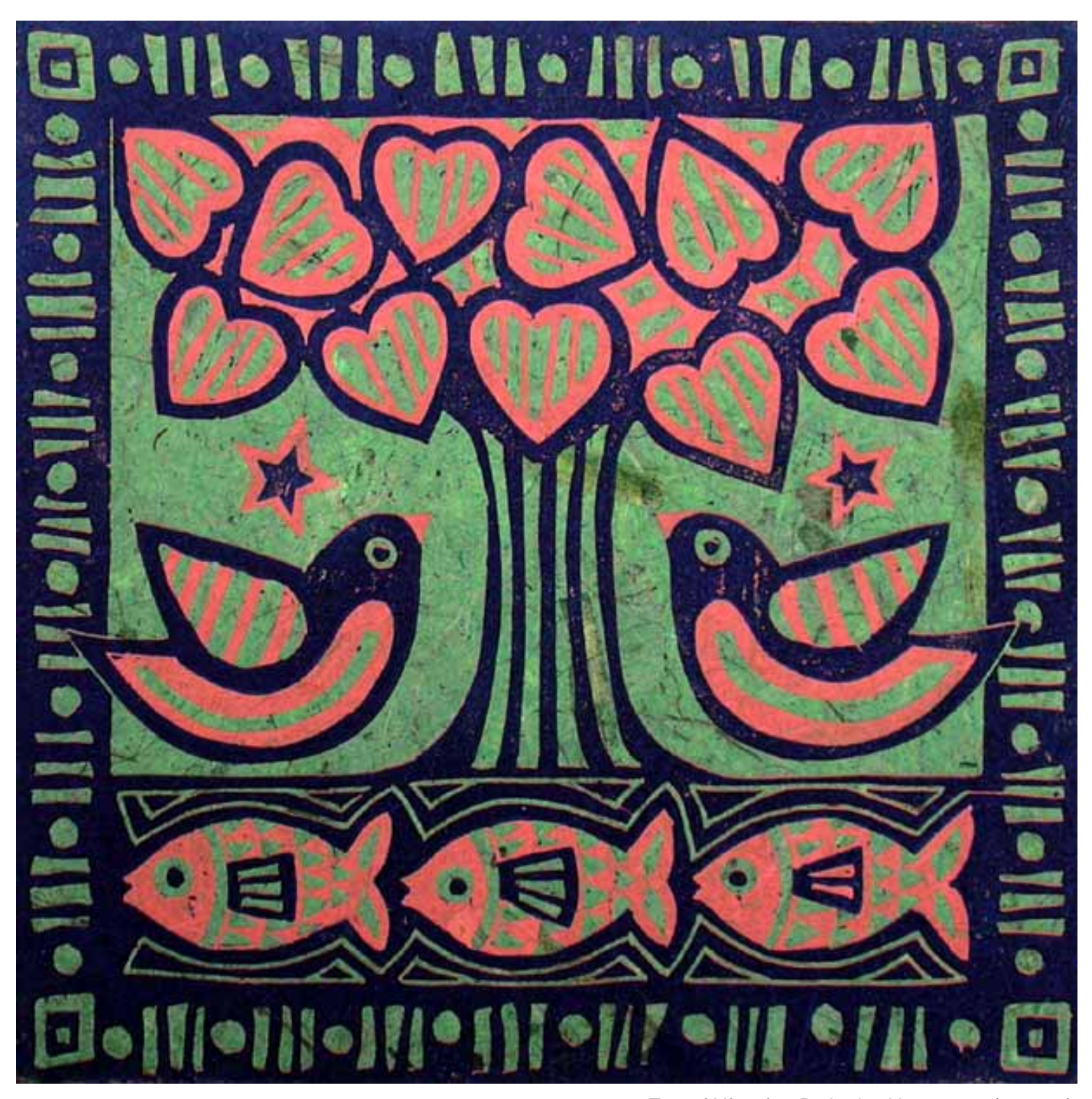
Tree of Life, 4/10, Reduction Linocut, 11 1/4 x 11 1/4