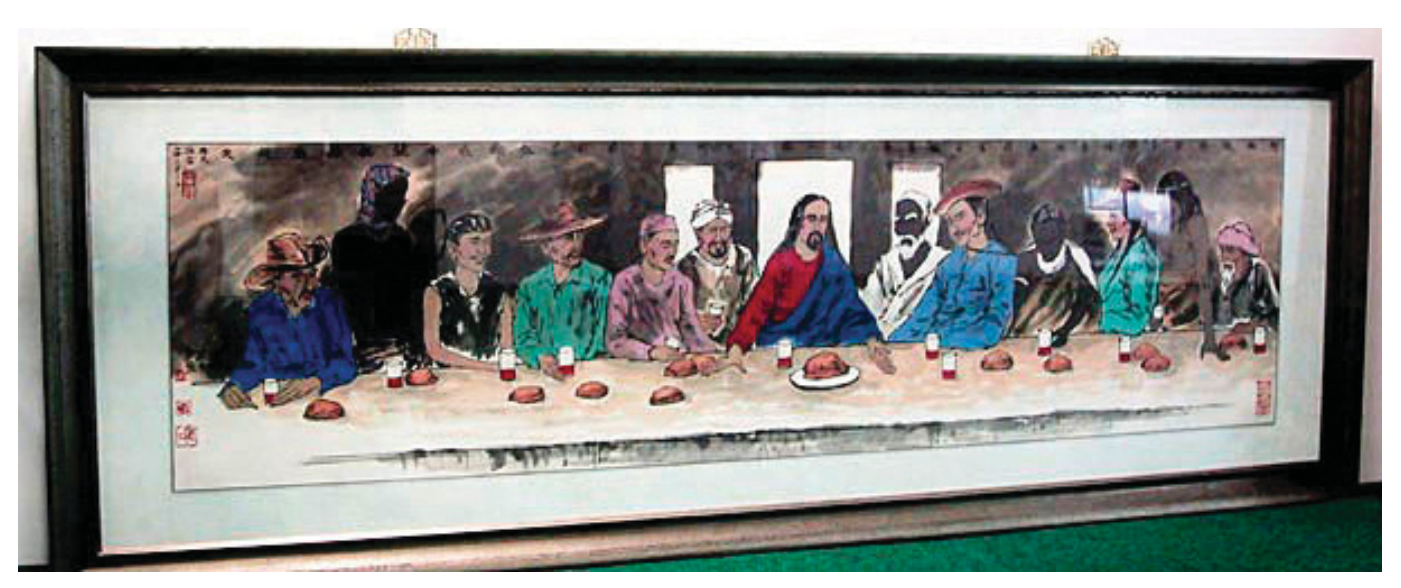
Their version appears to be the same size as one of our 40" giclees on paper. Wonder where they saw it?

Supplied for your amusement . . . a friend e-mailed the following to me from Singapore. He'd happened across a certain gallery and found a most interesting representation of The Last Supper with Twelve Tribes. He inquired and was told it was an original work by a Chinese artist. I suppose I should be flattered. My friend wondered about international copyright infringement, but in fact this one is different. At least it's one way to get international exposure. (And now his work is exposed in America.) And this same message is going out.