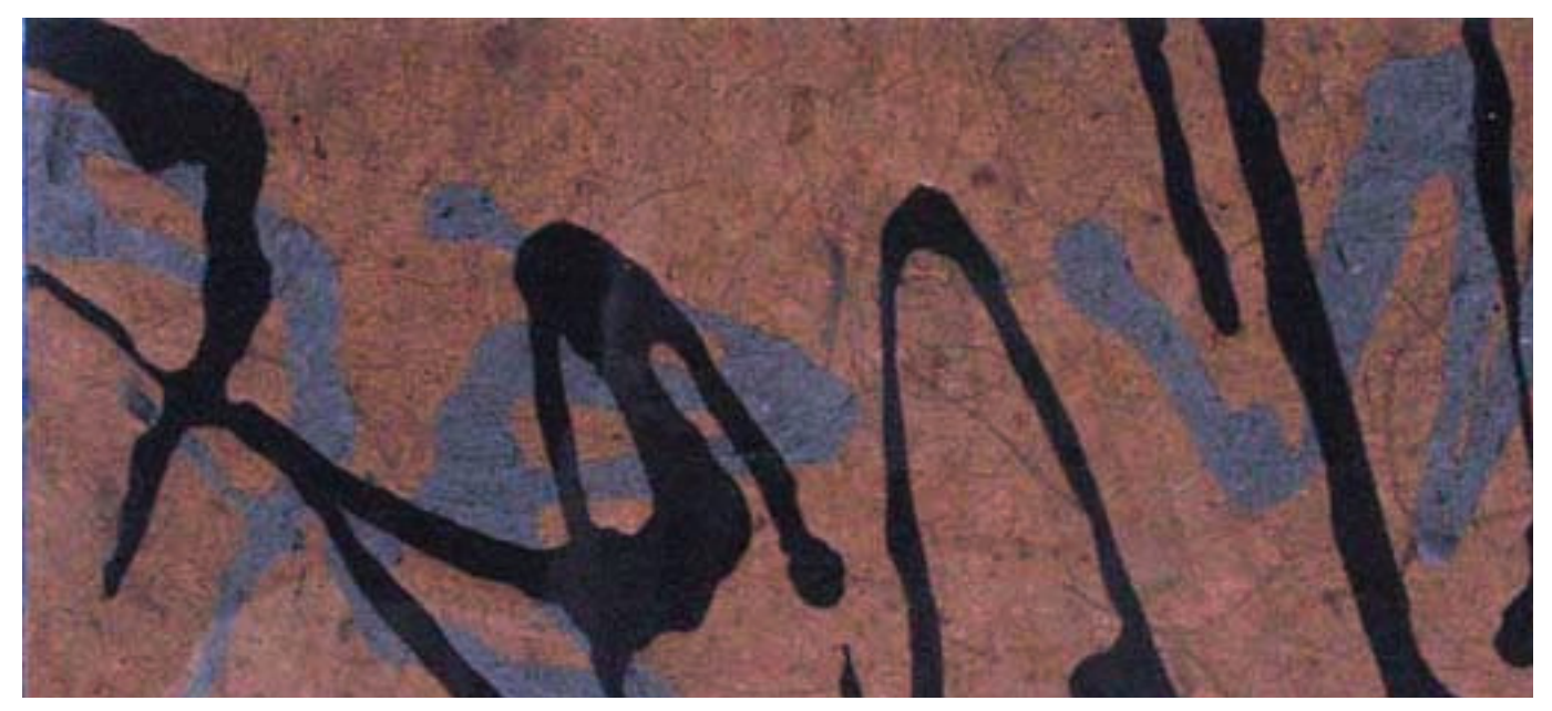
Kanji Dance, linocut, 5"x11"