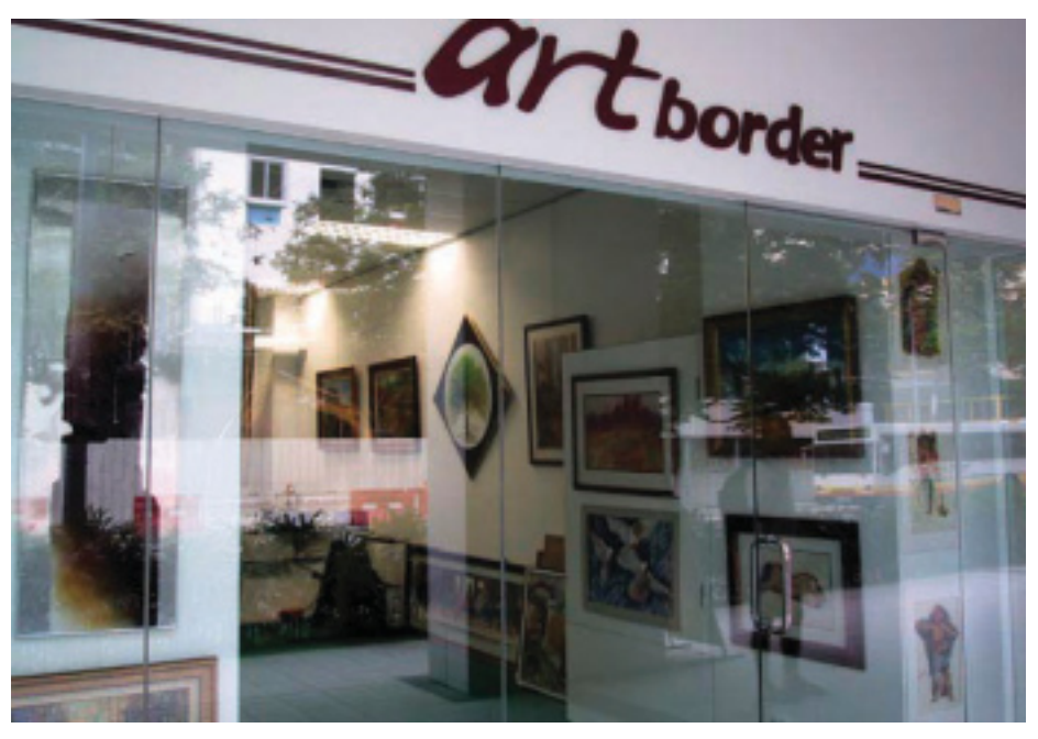
This is not Border's Books, but Border Art, in classic Singaporian cleanness.