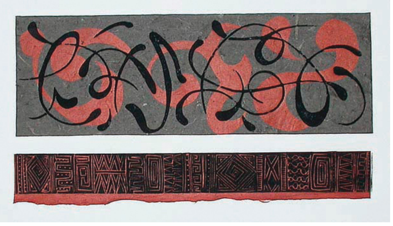
Orthographies 1, linocut, 6"x11"