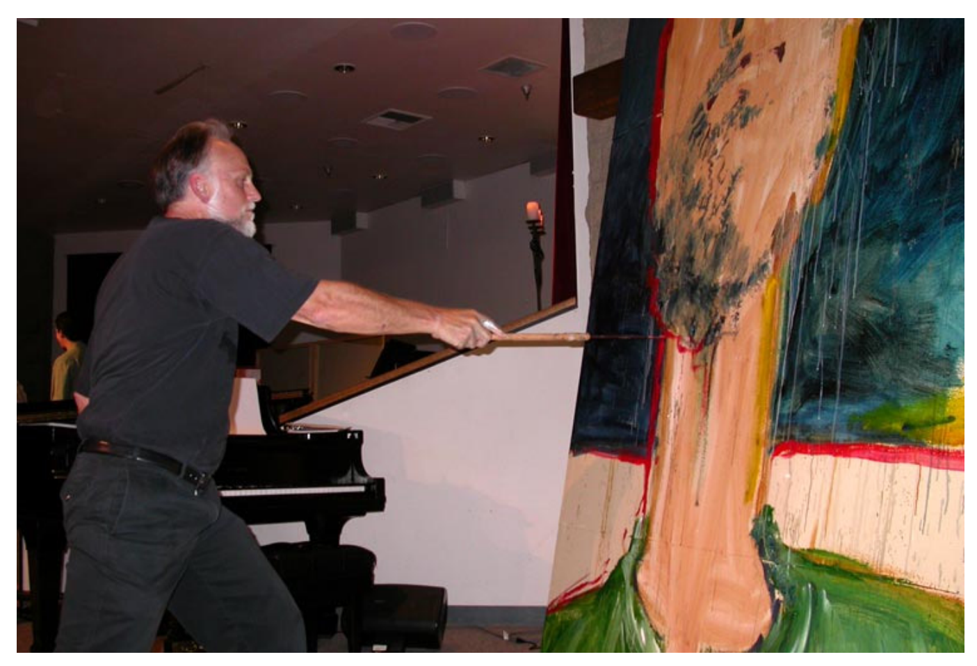
Talk about being watched while you paint . . . both from behind and here, by the painting itself.