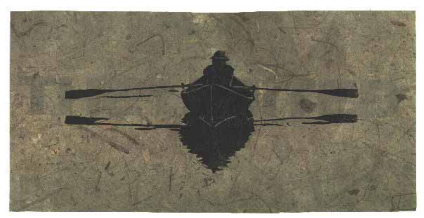
Four Oars, 6"x12"