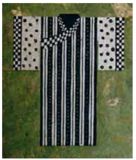
Kimono with Stripes, 8.5"x 7"

A good number of Anne's prints also adorn public walls in the region to the north—in Canada and the US. The Blue Horse Gallery, in Bellingham, Washington carries some of Anne's art for local collectors. These are also available at: <a href="https://www.annemooreprints.com/html/galleries_Linocuts.shtml">www.annemooreprints.com/html/galleries_Linocuts.shtml</a>.