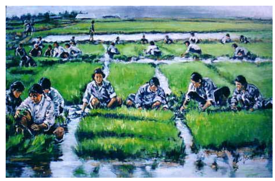
Green Fields, oil 48"x 30," (below) Paddy Planters, oil, 48"x 30"