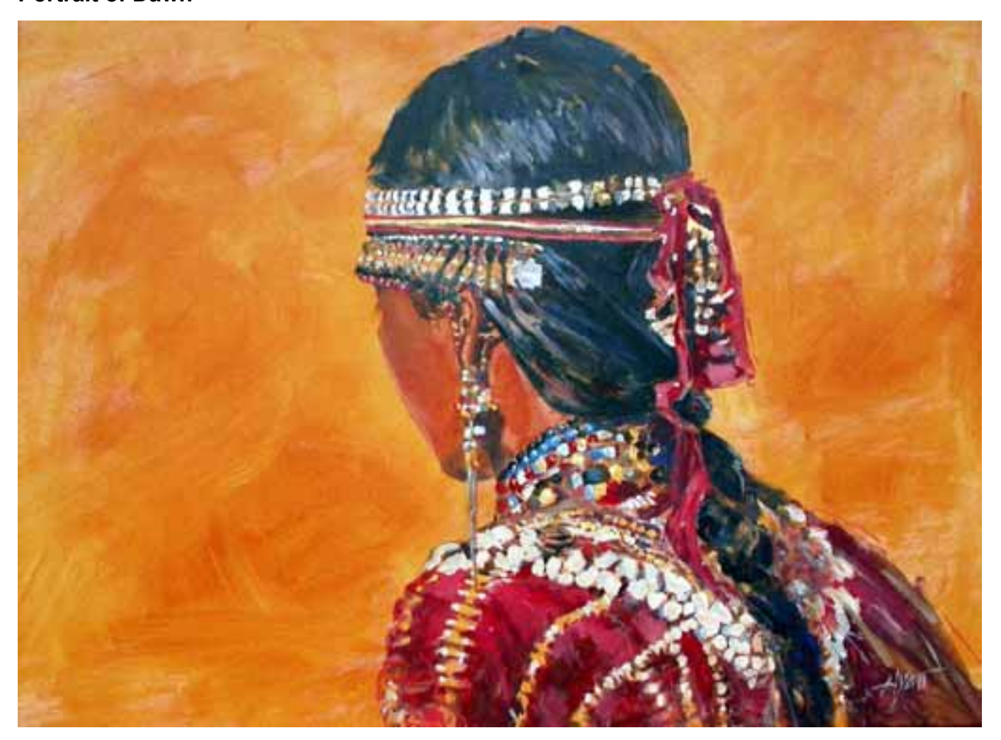
Walking Away, acrylic and oil, 38"x 28" (www.mooreandmooreart.com/html/galleries Paintings.shtml)