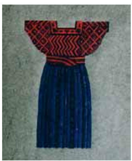
Guatemalan Finery, 8.5"x 7"