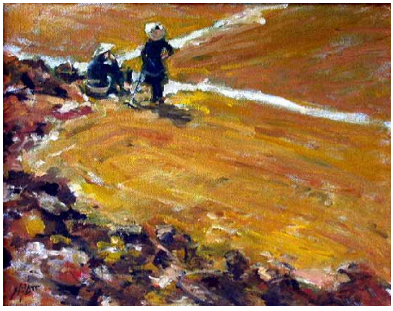
China Reapers, 14"x 11," a more recent painting, and much smaller, but since were on a China theme . . .

As usual, my paintings covered a wide range of ethnics. But what with a large Chinese society in Vancouver, I was once featured in a Chinese newspaper. I learned later they'd headlined me a "Famous Canadian Artist." I was American, and painting just three years! Still, it was nice, even if my mother couldn't read it!