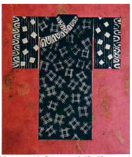
Kimono with Squares, 8.5"x 7"